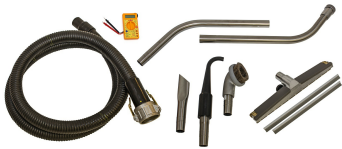
Ø1.5" (Ø38 mm) Static Dissipative Tools and Accessories - Optional