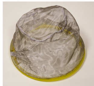
Liquid Filter - Included