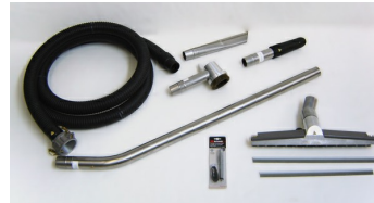
Ø2" (Ø50 mm) Static Dissipative Tools and Accessories - Optional