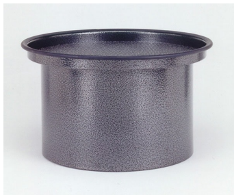
Activated Carbon Cartridge - Optional