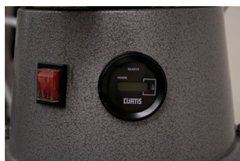
Hour Counter for MRV models - Included