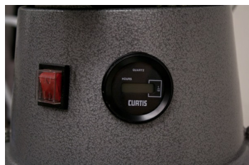
Hour Counter for MRV models - Included