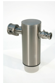
Mercury Recovery Separator with Jar - Included