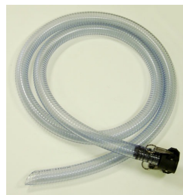
Clear Suction Hose Assembly for use with Mercury Separator - Included