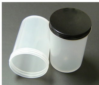
Jar for Mercury Recovery, 20 oz (540 ml) with lid - Optional