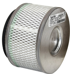
HEPA Filter - Included