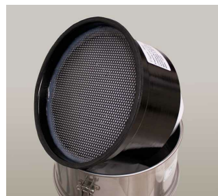
Activated Carbon Cartridge for Mercury Recovery - Included